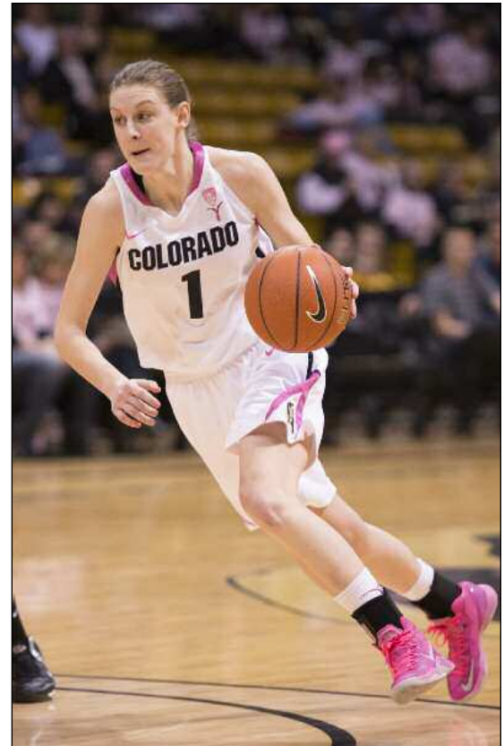
Colorado was ranked as high as No. 11 in the AP poll for three weeks during the 2013-14 season, its highest mark in 10 years.