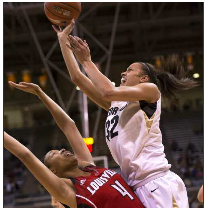
Colorado's 70-66 win over Louisville on Dec. 14, 2012 was its 14th all-time over a top 10 opponent and first since 2002.