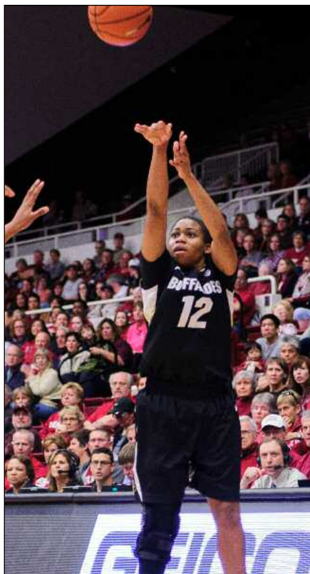
Colorado played six top 10 teams in 2012-13 and at one point played three straight on the road, a program first.

*NCAA; !AIAW; ^Conference Tournament #Rankings listed as AP/WBCA. AP poll began in 1977, WBCA poll in 1985