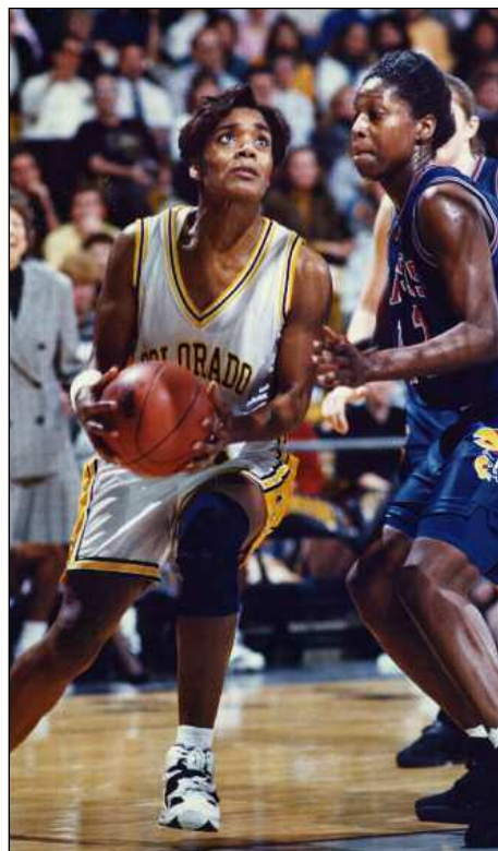
Colorado has eight wins over ranked Kansas teams, the most against any one opponent.